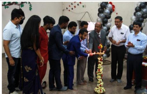
Lighting the Lamp by Alumni Students