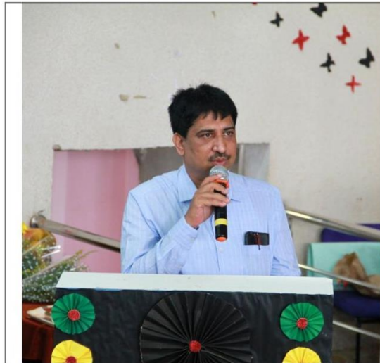
Addressing Alumni by HOD