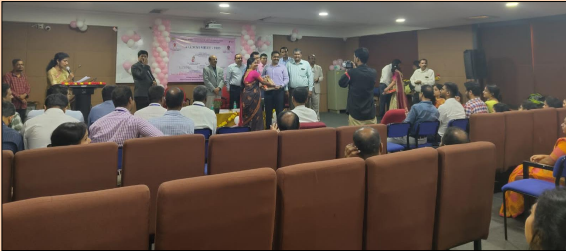
Felicitation to the alumni by faculty and HOD