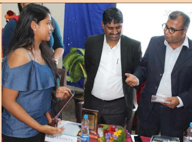
Mementos presented to Alumni by Chief Guest