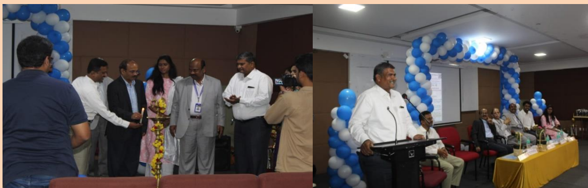
Photo Gallery During Alumni Meet 2021-22