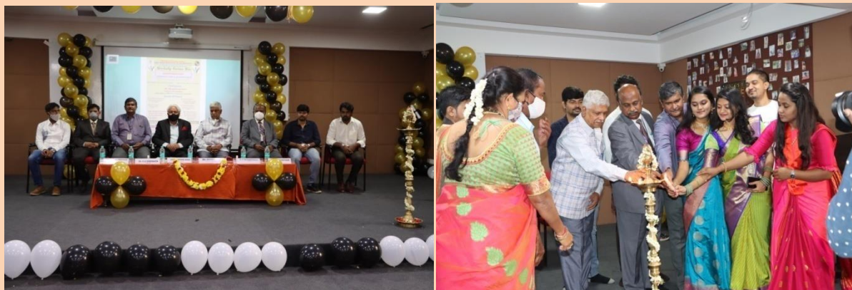
PHOTO GALLERY DURING ALUMNI MEET 2020-21