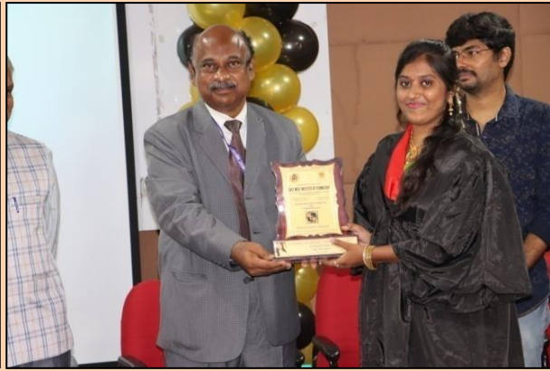
Meritorious Students were awarded by the dignitaries.