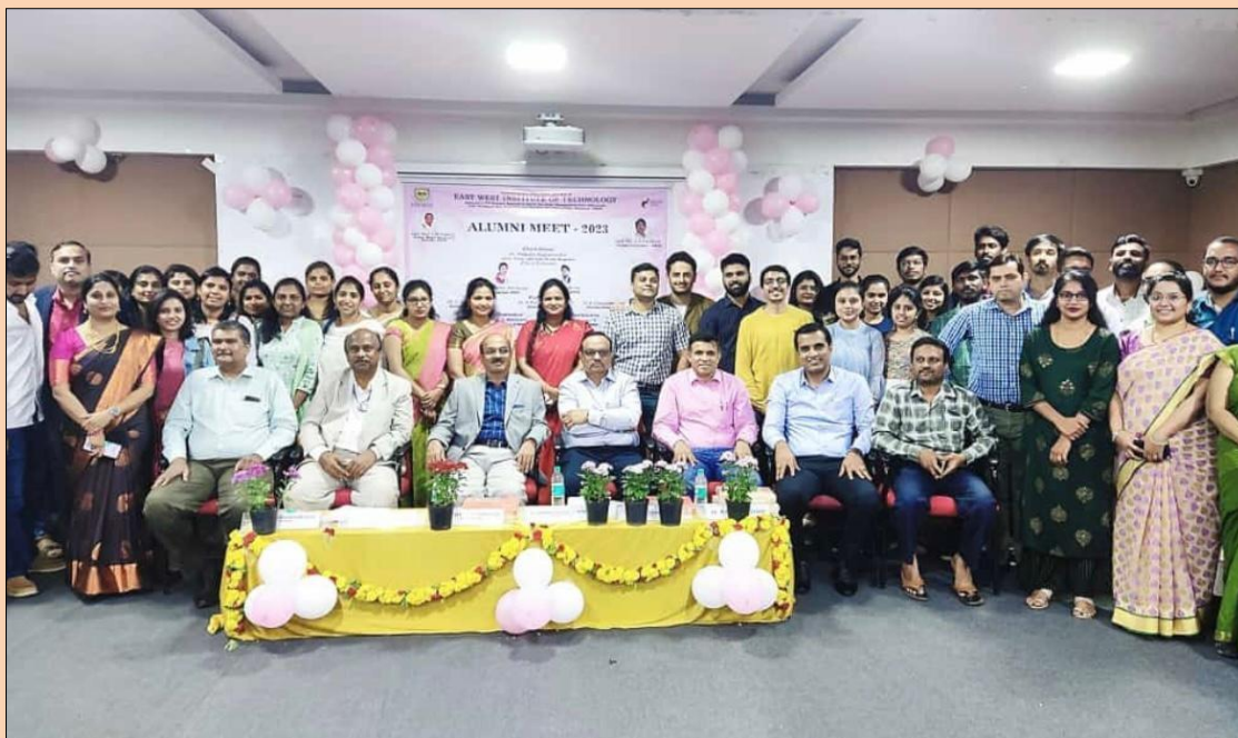
Group Photo of Alumni with the Chief Guest and delegates