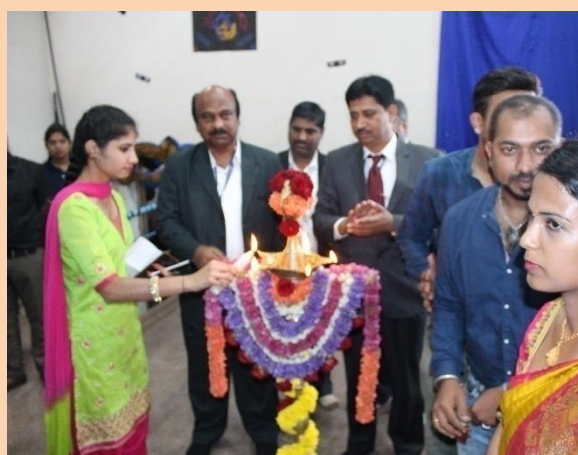
Lighting the Lamp by Alumni Students