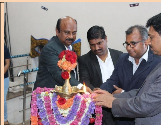
Lighting the Lamp by Guests, Principal & HOD