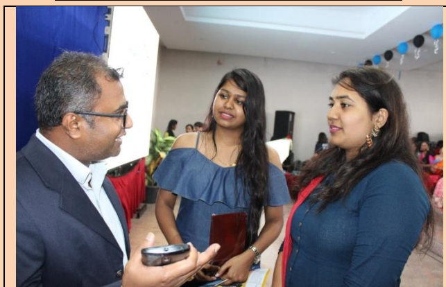
Interaction of Alumni with Chief Guest