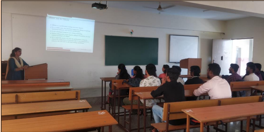
Speaker addressing the students