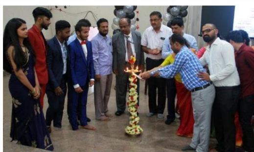
Lighting the Lamp by Guests, Principal & HOD