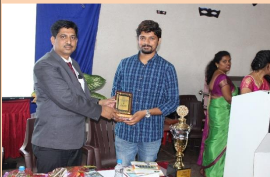
Mementos presented to Alumni by HOD