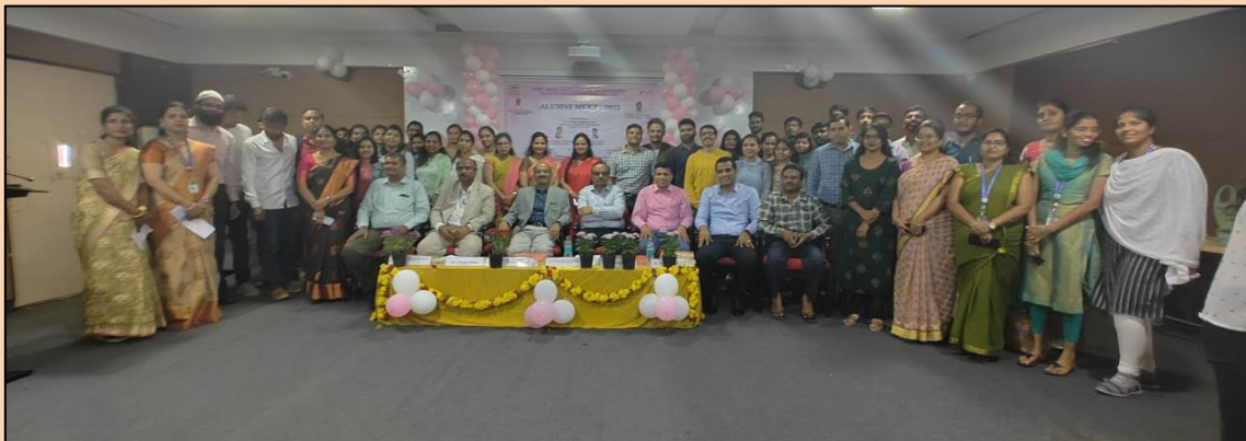
Group Photo of Alumni with the Chief Guest and delegates