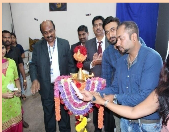
Lighting the Lamp by Alumni