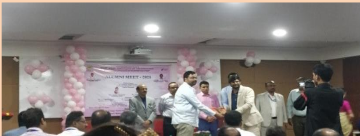
Speaker interacting with the student participants