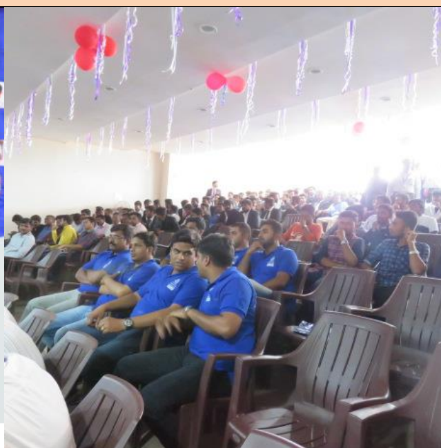
Audience during the session