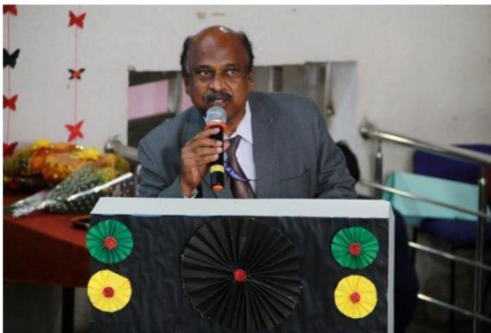
Address by Principal