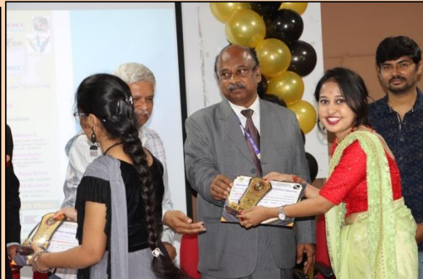
Meritorious Students were awarded by the dignitaries.