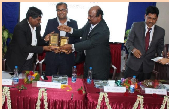
Mementos presented to Guests by Principal