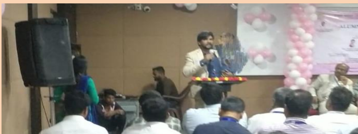
Speaker addressing the gathering