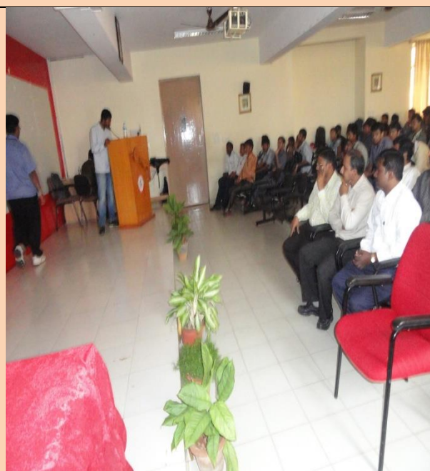
Speaker and students interaction