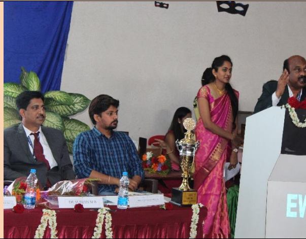
Address by Principal