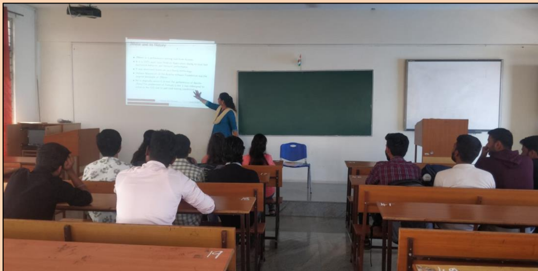
Speaker addressing the students