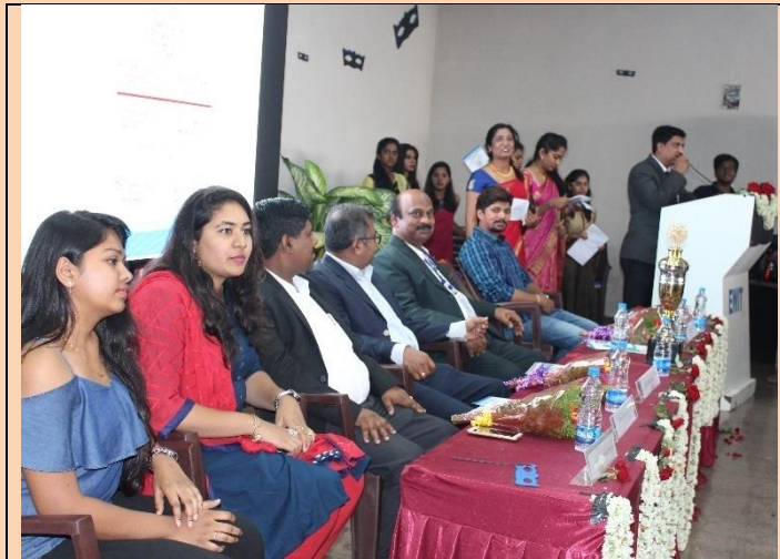
Addressing Alumni's by HOD and Alumni's on dais with Guests